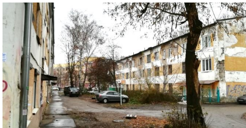
Fig. 1. Part of the communal space of the SK-1 plant townsite, 1932-1934

It seems that such a fate awaits the Soviet workers settlement (" sotsposelok ") of the Synthetic Rubber Plant. It was built in Yaroslavl, Russia in the first half of the 1930s and reflects the basic principles and objectives of urban development in the studied period (Fig. 1). In the evolutionary development of urban planning concepts of the Soviet era, this residential format became an intermediate stage between the theory of "garden settlements" of housing cooperatives (HCCP), influenced largely by Howard's garden cities (garden-city Diadkovo as an example in Yaroslavl), and social cities (e.g., Yaroslavl Rubber and Asbestos Plant (YarRAK) social city), which became the basis in the development of the USSR [1].