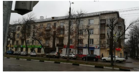
Fig. 5. Residential 4-storey apartment building at ul. Mologskaya (Pobedy) (second stage of house construction) Thus, "SK social settlement" is a typical example of a standardized solution of the architecture of residential buildings, as evidenced by the layout of the sections and equal living conditions (quality of housing) of rank and file and management employees of the enterprise. One can see the same tendencies (in the same sequence) in the residential buildings of the worker settlement as elsewhere in the USSR, and it achieved the main goal at the time formulated by G.Ya. Wolfensohn xi .

to the fourth floor). It was apparently dictated by the orientation to one of the main city streets, as well as changes in time building requirements (Fig. 5).