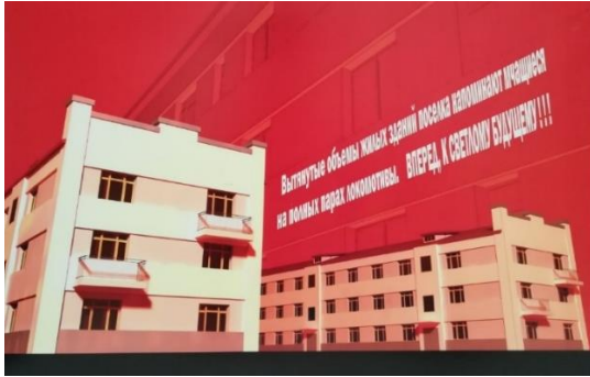
Fig. 6. Computer model of the residential development of the working village of the SK-1 plant. Computer graphics – S. Shawman

accurately chooses the layout of the building, on the one hand, playing with the strengths and weaknesses of the standard projects of houses, on the other hand, satisfying the regulatory requirements of that time for the artistic design of working-class housing, particularly cooperative housing xii (Fig. 6).