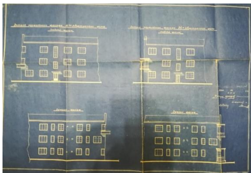
Fig. 4. Fragments of facades of 18- and 24-apartment buildings of the first stage of SK-1 plant settlement, the drawings were signed on April 10, 1932

For the construction of the first stage of the settlement, a typical two-family section was chosen. It became the basis for the design of four three-storey residential buildings placed at the ends of the street. The building was constructed in the ul. Grazhdanskaya (two three-section and two four-section, 18- and 24-apartments, respectively). This choice was very typical then. It was an attempt to get closer to creating 'standardized urban housing designed for the mass working consumer'. In doing so, the condition of creating the most economical in all solutions and indicators buildings was met: from the used improvised materials – silicate or ceramic bricks (which were available including from demolition of famous constructions), insulation with fiberboard slabs, the simplest volume solution of buildings as parallelepipeds, no balconies, limited number of types of windows and doors – the main elements of facades to obtain the maximum number of living space apartments in room-by-room settlement (Fig. 4).