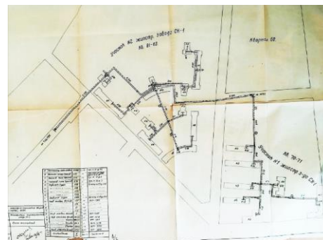
Fig. 2. Archival drawing from the heating project of SK-1 plants settlement (first and second stages of construction), 1935

It follows from the above-mentioned installations that the "SK plant townsite" is a typical example of such a planning solution. The archive drawings for the heating of the SK-1 plant settlement (1935) and the master plan for the project of building a 40-apartment house for the SK-1 plant at ul. Lubimskaya (now ul. Tchajkovskiy), covering the entire area of the neighborhood, including the first phase of the SK-1 plant settlement, can clearly read all the basic solutions adopted in accordance with the requirements for the planning of a worker settlement of the turn of 1920s-1930s (Fig. 2).