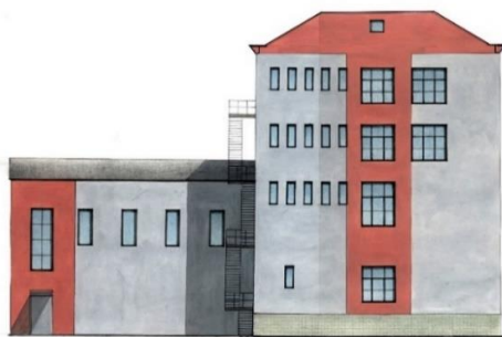
Fig. 7. Club-canteen of the SK plant social settlement, 29 ul. Pobedy, 1934. Side and main facades

The brick building of the club-canteen also looks original [7]. Designed to serve a single company, it was a compact box (7,500 m 3 ). The enlarged scale of the building as compared to the residential buildings singled it out from the environment as a composite urban accent of the worker settlement. The site at the intersection of ul. Mologskaya (ul. Pobedy) and ul. Grazhdanskaya (October prospekt), was chosen as the construction site, with a significant indentation from the latter, where a green square was laid out in the formed triangular area. The composition of the building is not actively angled due to the chosen position. At the same time, the facade of the building on the side of ul. Grazhdanskaya (lateral) has a