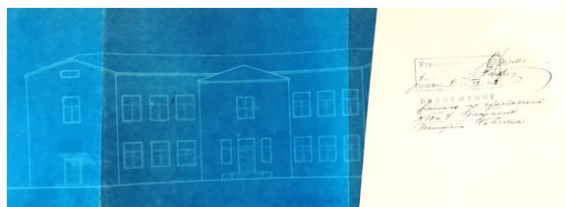
Fig. 8. Archival drawings of the plan and facade of the kindergarten building showing the date of approval of the project on July 4, 1932